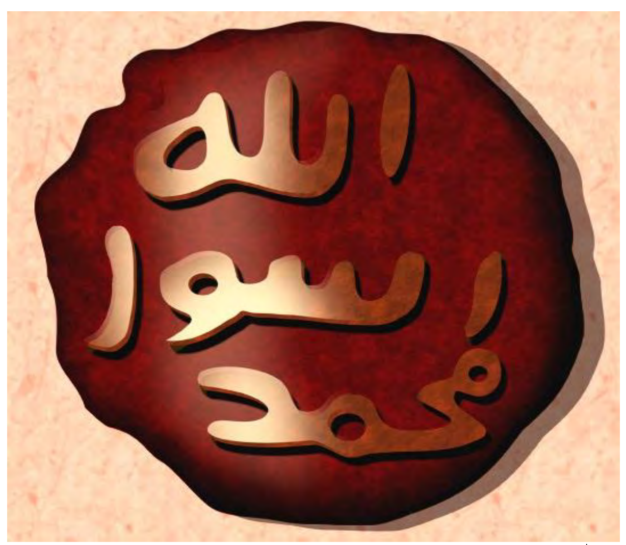
Just look at the beauty of the stamp of Nubuwwat of our prophet Muhammad

"No doubt it's the greatest favour of ALLAH (الله جبل ث ن ) on Muslims that He (Allah) sent a Rasool (اليك رسول) among them". (164